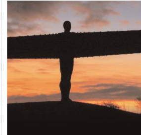
The Angel of the North

We welcome applications from mature students and will consider on an individual basis, those who do not meet traditional entry criteria but have an appropriate level of relevant experience. We are supportive of the University's Access to HE course, the HEFC, which provides an excellent basis for preparing adult students for entry into Higher Education. More details are available from the Return to Learning Service.