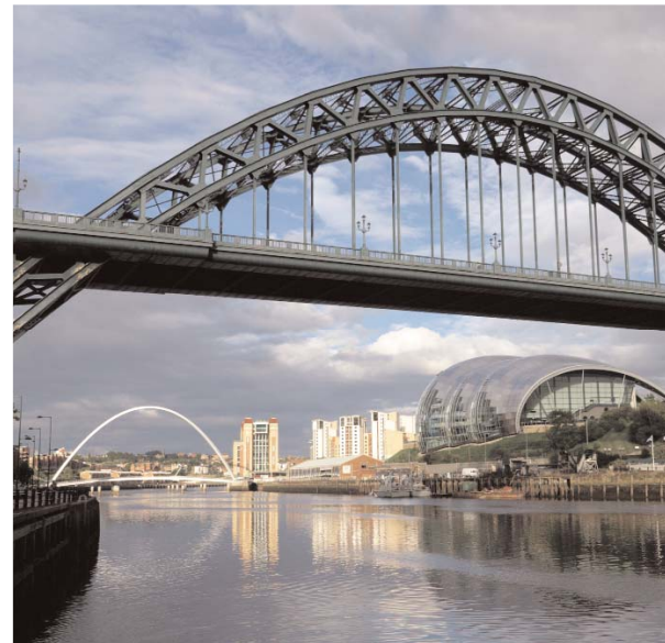
Newcastle Gateshead Quayside