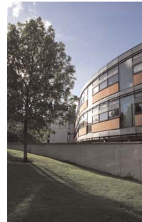
Coach Lane Campus