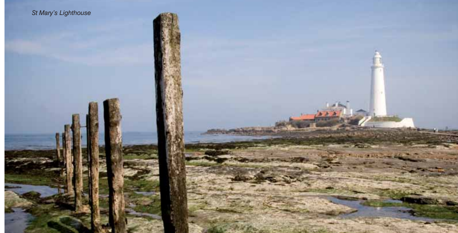
St Mary's Lighthouse

As well as having our own art gallery, there are countless museums and art galleries spanning the city, offering something for everyone. Public art such as the Angel of the North, Glow, the Riverside Sculpture Park, and the Blue Carpet also contributes to the city's thriving cultural scene making sure that art is not just confined to the galleries. www.visitnewcastlegateshead.com