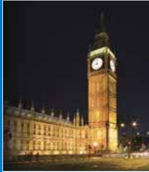
Big Ben, London