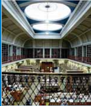
The Literary & Philosophical Library Newcastle