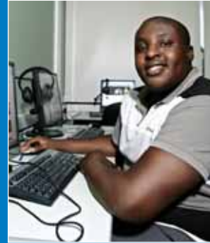
French and Business Student