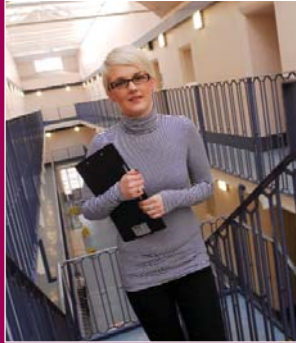
Student; Durham Jail