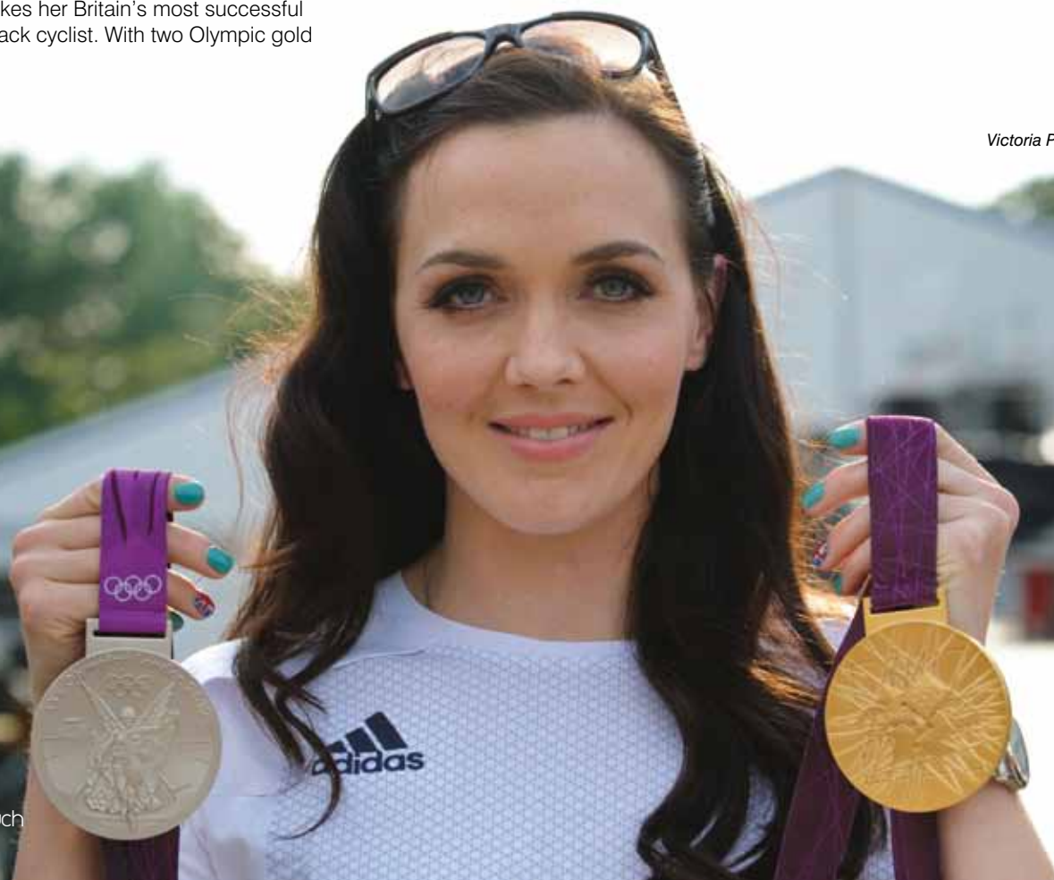
Victoria Pendleton, MBE

With two Olympic gold medals, Victoria is one of the country's most successful female Olympians.