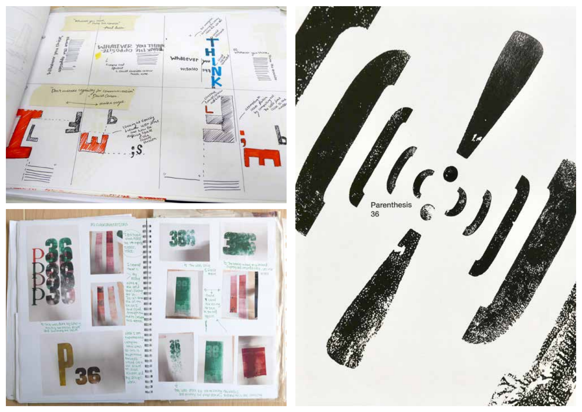
Slide 2 - Typographic Development